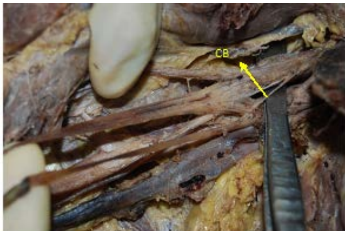
Figure 4: Shows a communicating branch to Median nerve from Musculocutaneous nerve in the left upper limb