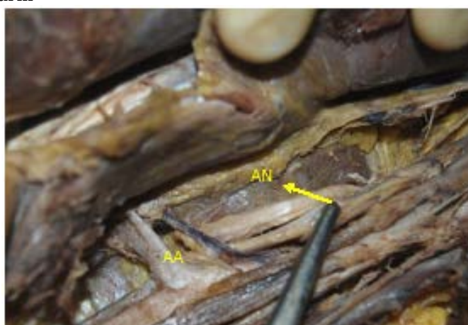
Figure 3: Shows AN - Axillary nerve was found lateral to the Axillary Artery (AA). Radial nerve was deeper to Axillary nerve. Ulnar nerve was medial to Axillary nerve.