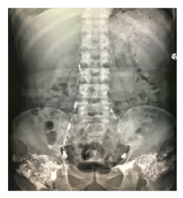
Figure 3. Lymphagiogram shown disruption