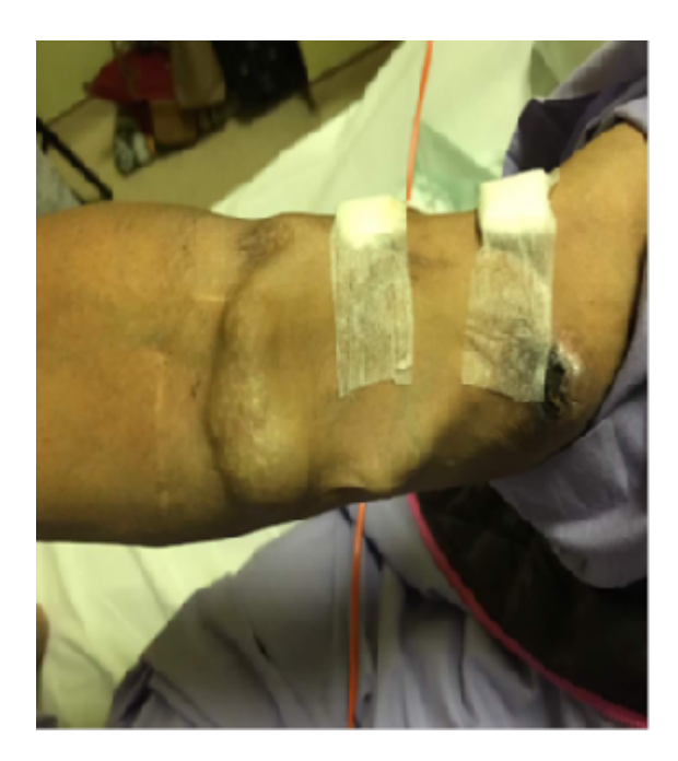
Figure 4. Right arm AVG of lymph flow cranially

tral venous catheter especially in newborn infants, children and adults [2] . The diagnosis is confirmed by the gross appearance of the pleural effusion, usually milky appearance and the composition of the fluid (triglycerides level higher than 110 mg/dl and elevated lymphocytes count) [2] [3] . The method of treatment of chylothorax in this situation is controversial. It depends on both of causes and symptoms. The approach is variety, can be from the conservative treatment to surgical intervention. Like in our patient, a low fat diet with medium chain triglycerides (that are di-