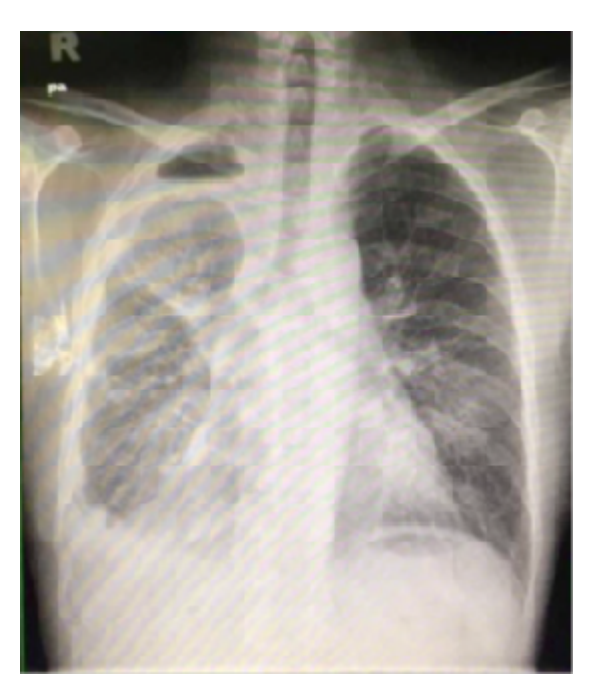
Figure 1. CXR shown Right pleural effusion