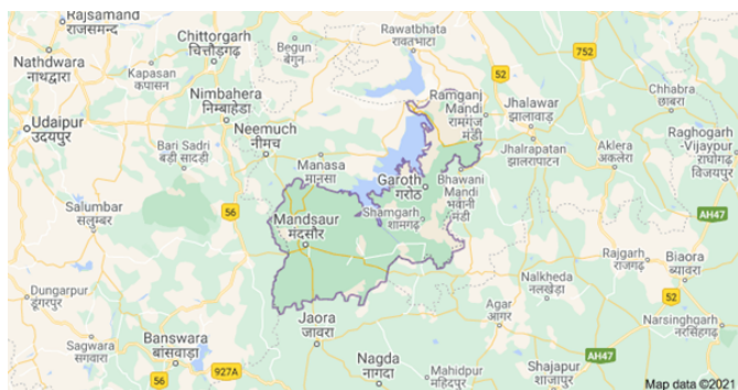
FIGURE 2: Map of Mandsaur district