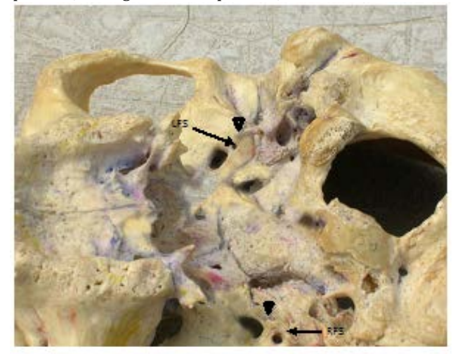
Figure 1-The left foramen spinosum (arrow)seen anterior to spine of the sphenoid(arrow head),right foramen spinosum(arrow) seen posterior to spine of sphenoid(arrow head).LFS-left foramen spinosum, RFS-right foramen spinosum,