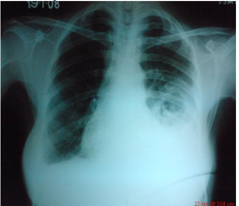
Figure-1 Chest X-Ray: showing pyogenic cavity in left lower zone

The patient was started on oral levofloxacin and was nebulised. Following the antibiogram report, IV Gentamicin was started. The fever subsided and the patient responded well to this line of treatment and got discharged after 7 days.