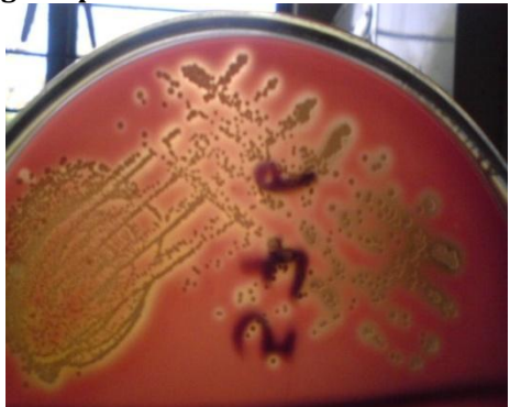
Figure-2 Blood agar showing beta haemolytic colonies of Staphylococcus aureus