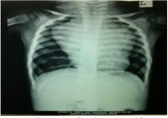
Figure 1:Chest x ray showing gross widening of superior mediastinum.

CT thorax suggested a well defined mass of 9.8*6.8*5.2cm in anterior mediastinum extending into middle mediastinum and draped over mediastinal vessels and cranial aspect of heart.(Figure2)