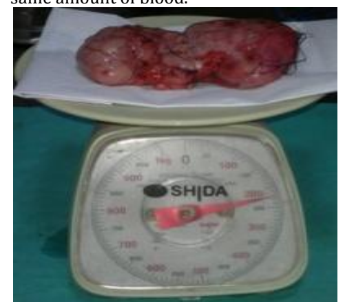
Figure 4: Mass weighing 230gm

Intraoperatively HR was in range of 110- 120/min, BP range was 80 - 96/54-64 mmhg, SpO<sub>2</sub>, EtCO<sub>2</sub>, and ECG remained within normal limits.CVP was maintained between 5-8 cm of h<sub>2</sub>o. During operative procedure chest was opened with left thoracotomy and tumour was visualised. During dissection of tumour, on two occasions surgery had to be stopped temporarily as patient developed hypotension with bradycardia (50-60 mmhg, 60-70 /min ) may be due to compression of major vessels while handling of the large tumour. This was managed with supplementation of 100% oxygen with crystalloids and inj.glycopyrrolate was given in a dose of 0.01mg/kg. Did not require any ionotropic support. Complete resection of tumour weighing 230gm was possible(Figure4) with intraoperative blood loss 30-40ml which was replaced with same amount of blood.