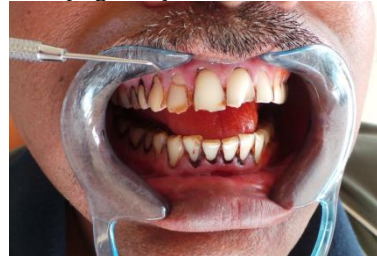
Fig.no. 1 Pre-operative view

13.The patient was recalled after 6 months for follow up and it was observed that both endodontic and restorative treatments remained clinically acceptable for the entire time.(Fig.no.8)