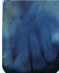
Fig.no. 2 Pre-operative IOPAR