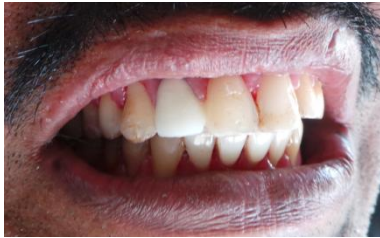
Fig.no.7 Cementation of crown