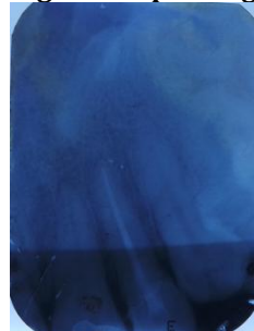
Fig.no. 4 Obturation