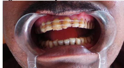
Fig.no. 3 Splinting