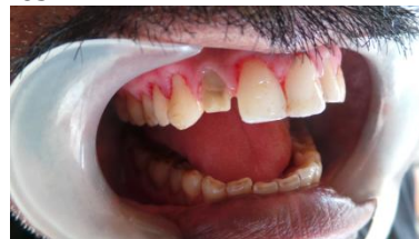
Fig.no.6 Crown reduction